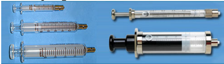
Standard Glass Syringes