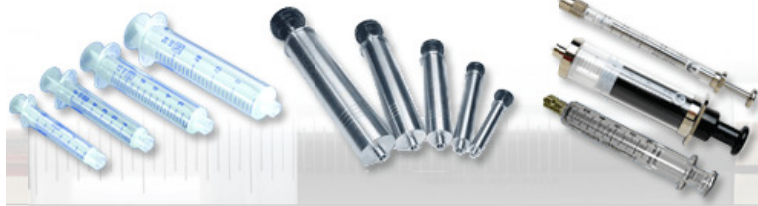
Disposable Plastic Syringes Plumbing Supplies